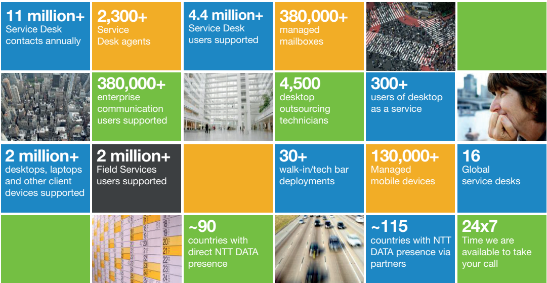
Figure 1: NTT DATA Managed End User Services footprint

Value co-creation: We partner with you to create solutions and integrate services aligned with your business strategy, and seamlessly enable capabilities and technologies in support of your journey toward a digital-enabled business.